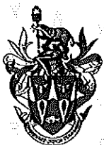
CIWM Chief Executive Officer

The Chartered Institution of Wastes Management