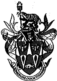
CIWM Chief Executive Officer

The Chartered Institution of Wastes Management